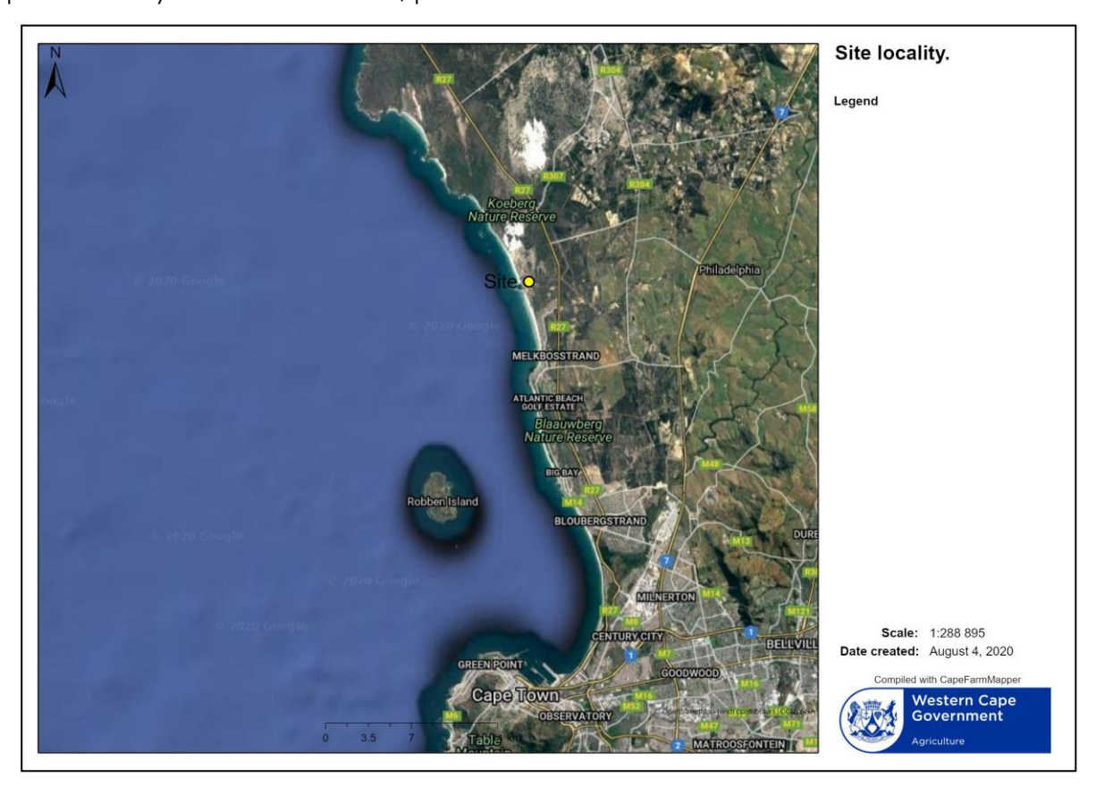
Figure 1: Locality of Koeberg Nuclear Power Station (site).

• Cape Farm Duynefontein No 1552, portion 0