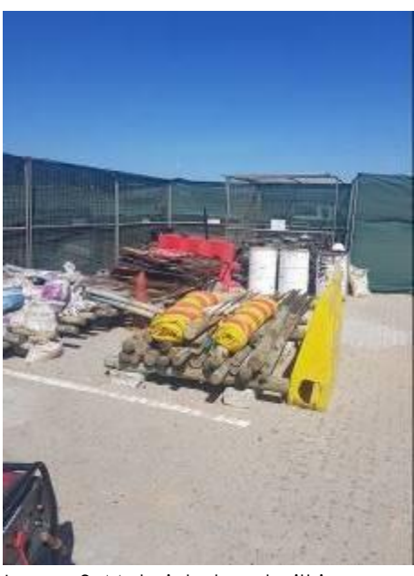
Image 3: Materials stored within a demarcated area within the site camp.