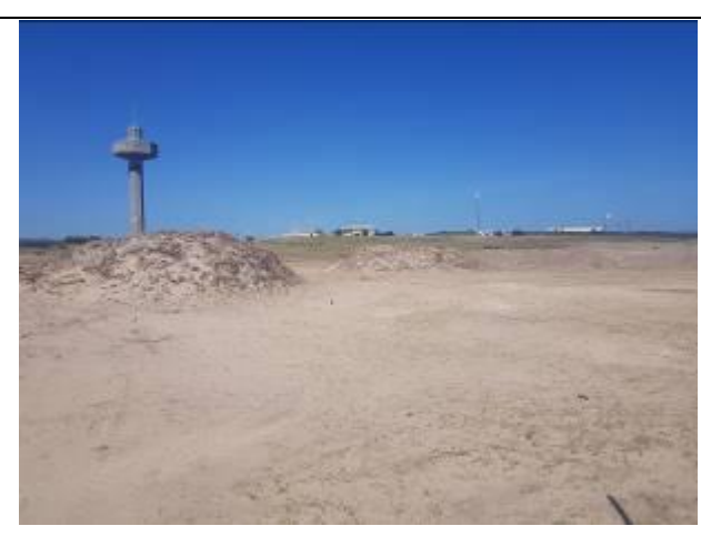
Imahe 12: Stockpiling of topsoil.