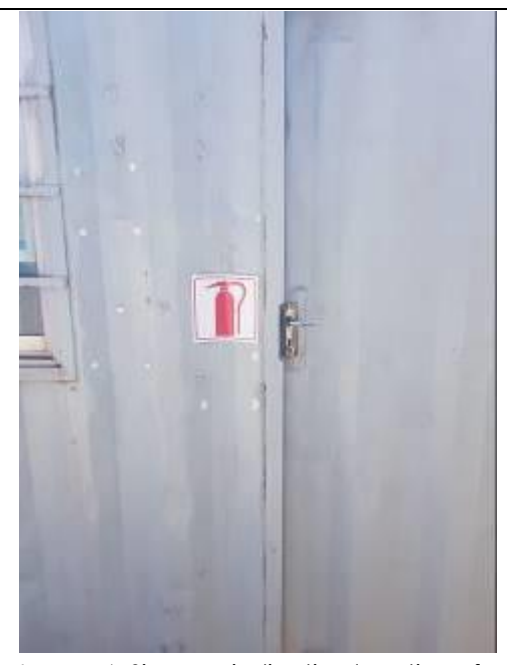
Image 6: Signage indicating location of fire extinguisher within site camp.