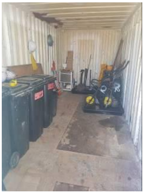
Image 1: Materials stored within a container within the site camp.